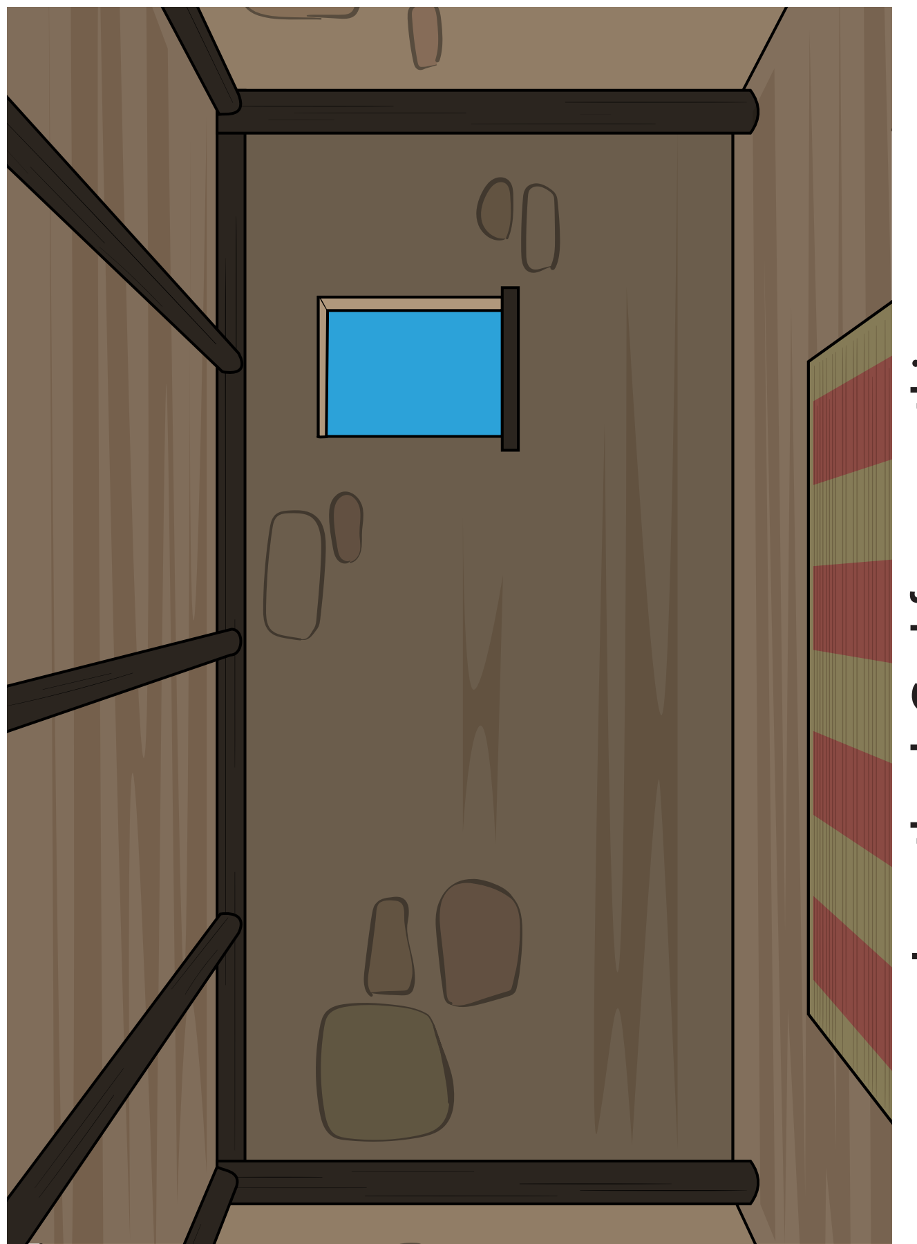
I can thank God for everything. Elisha's Room • 2 Kings 4:8-17